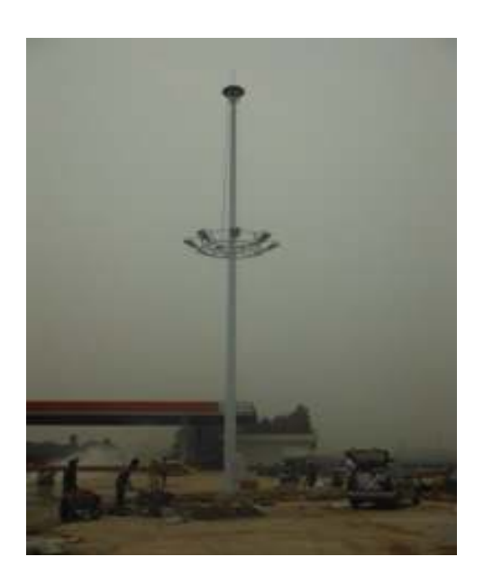
©2013 U-Tron (Beijing) Electronics Co., LTD All rights reserved Specifications are subject to change without notice